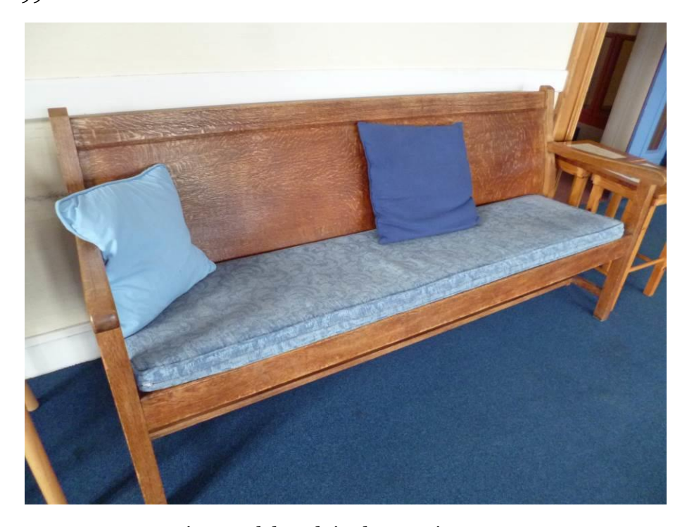
Fig.2: Oak bench in the meeting room

The meeting house is mainly furnished with modern furniture but there is a set of 12 oak benches with solid backs and plain arm rests, brought here from Stafford Street and probably made in the early twentieth century. A table in the meeting room was made by Tim Stead in c1990.