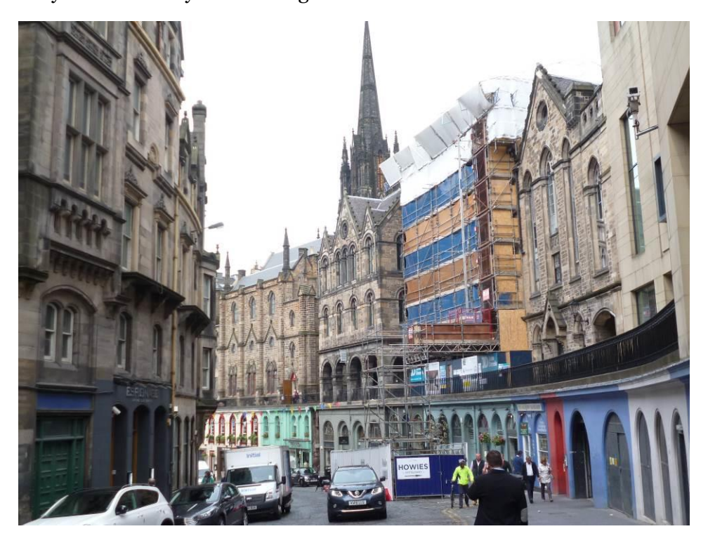
Fig.3: the meeting house is part of Victoria Street, located on Victoria Terrace, built 1860s

The meeting house is on the south side of Edinburgh Old Town, within the World Heritage Site. The building is situated on Victoria Terrace above the north side of Victoria Street, a distinctive curving street that leads from George IV Bridge down to the Grassmarket (Fig.3). The building is part of the planned redevelopment of this part of Old Town in the mid nineteenth century, and part of a group of eclectic Victorian buildings designed in various revival styles. There is a closed burial ground at The Pleasance, on the south-east side of the Old Town; the site includes the former meeting house built in c1810 and the burial ground contains graves but the grave stones have been moved to the perimeter. The Pleasance site is now owned by the University of Edinburgh.