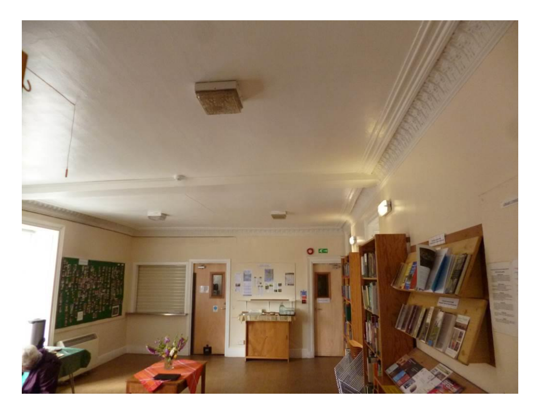
Fig.2: The library is in a former tenement, with plaster ceiling cornice